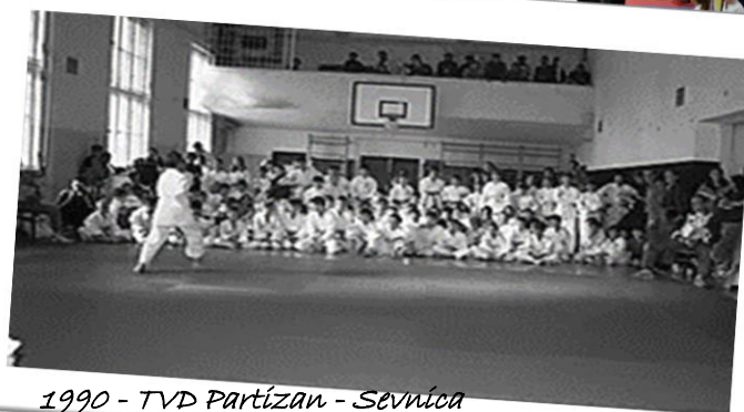
1990 - TVD Partizan - Sevnica

We wish you a comfortable journey and a pleasant stay in Sevnica. OSU !