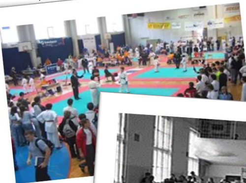
2006 - Sport Hall - Sevnica