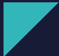
TABLE OF CONTENT