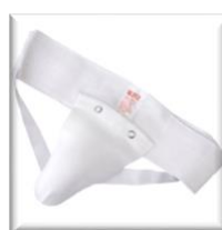
MALE GROIN GUARD.