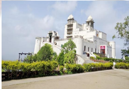
SAJJANGARH MONSOON PALACE