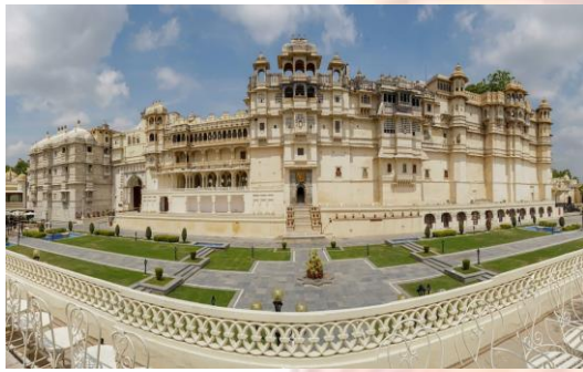
CITY PLACE OF UDAIPUR